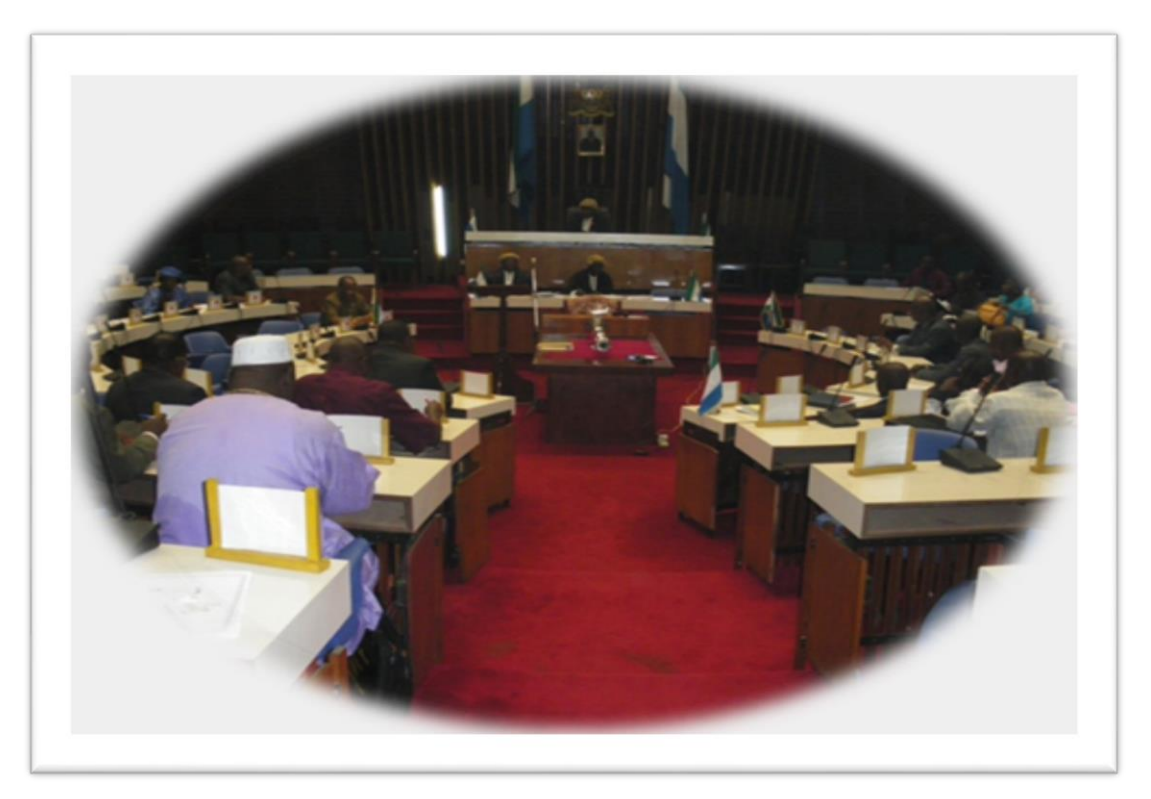
THE CHAMBER OF PARLIAMENT OF THE REPUBLIC OF SIERRA LEONE